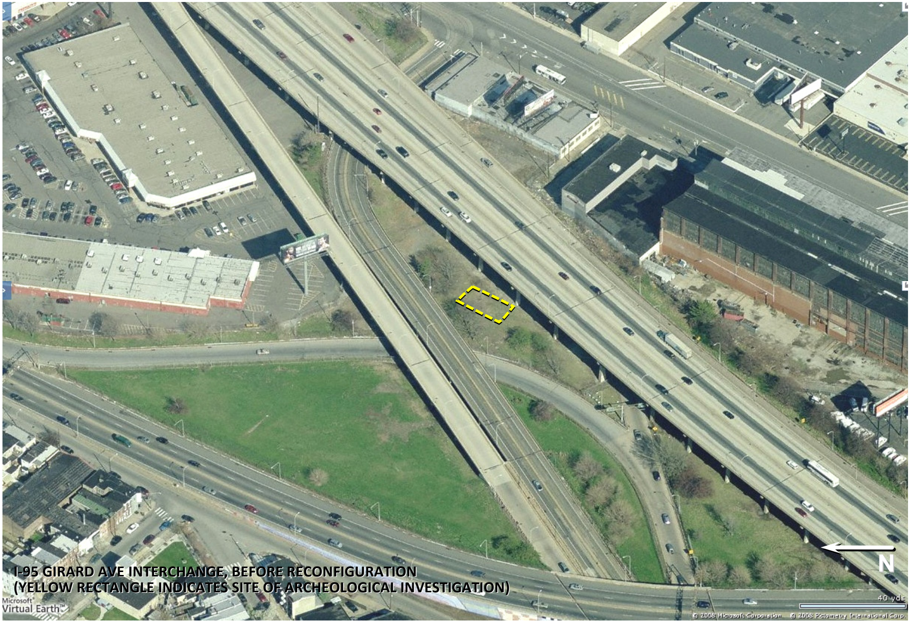
I-95 GIRARD AVE INTERCHANGE, BEFORE RECONFIGURATION (YELLOW RECTANGLE INDICATES SITE OF ARCHEOLOGICAL INVESTIGATION)