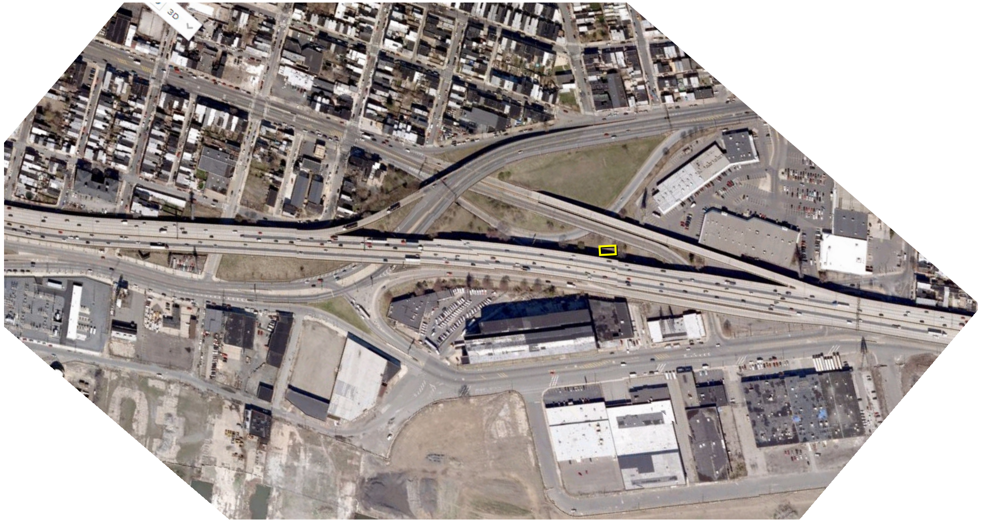
I-95 GIRARD AVE INTERCHANGE, BEFORE RECONFIGURATION (YELLOW RECTANGLE INDICATES SITE OF ARCHEOLOGICAL INVESTIGATION)