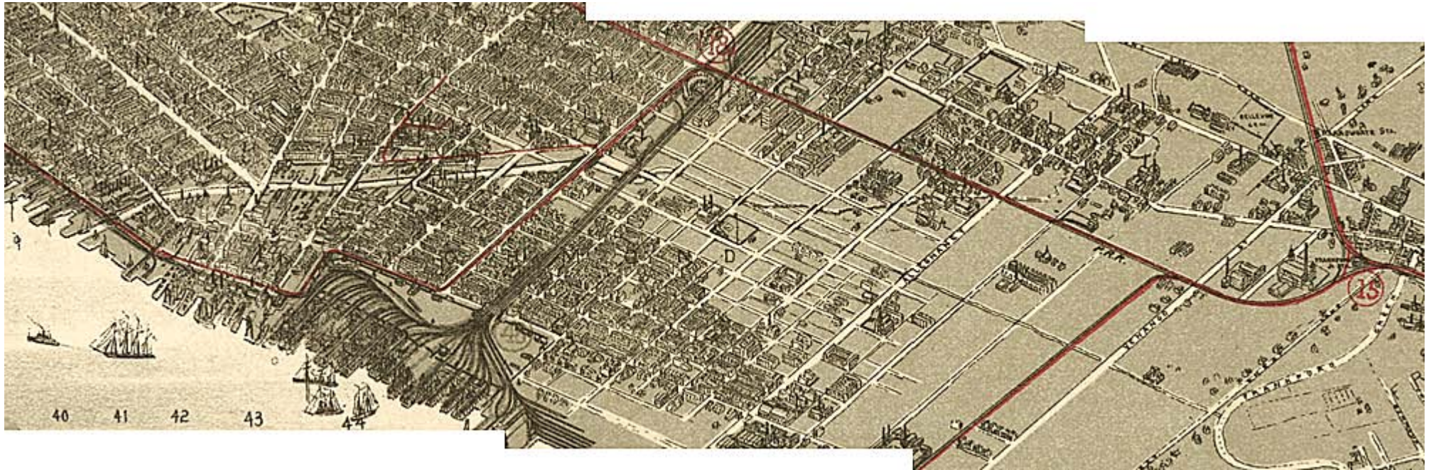
KENSINGTON NEIGHBORHOOD OF PHILADELPHIA, 1888