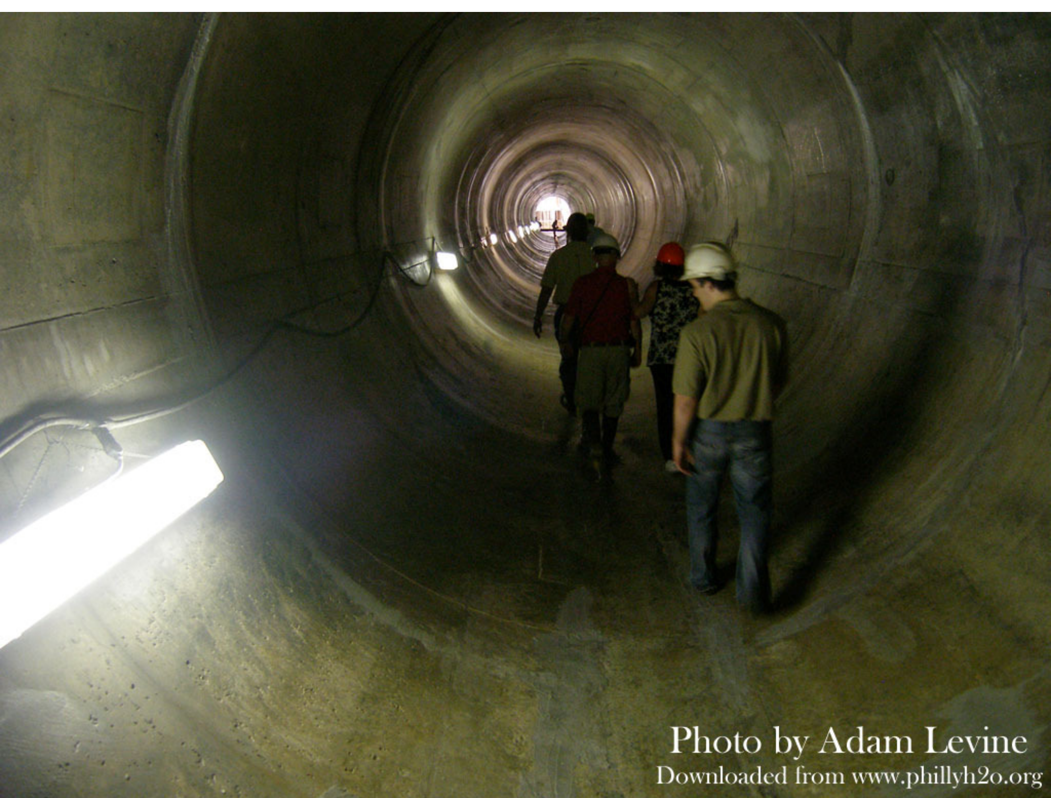
Downloaded from www.phillyh2o.org