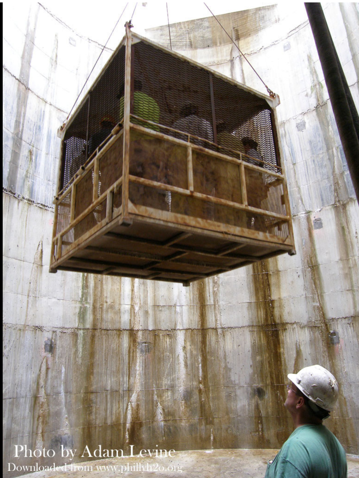
Downloaded from www.phillyh2o.org